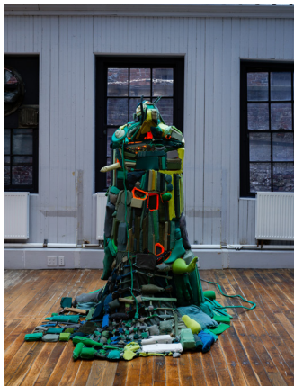
Baxter Koziol BONE-YARD with accessories 2024 New Dirt in green, orange, yarn, pine, wire 45 x 45 x 78 in 114.5 x 114.5 x 198 cm