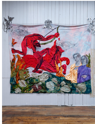
Tura Oliveira The Triumph of Death 2024 Steel, silver, resin, and hand-dyed silk 96 x 55 in 244 x 140 cm