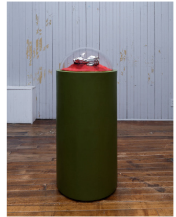
Tura Oliveira Agnes in the Wilderness 2024 Steel and hand-dyed silk, glass beads, resin, silver 45 x 22 x 60 in 114.5 x 56 x 152.5 cm