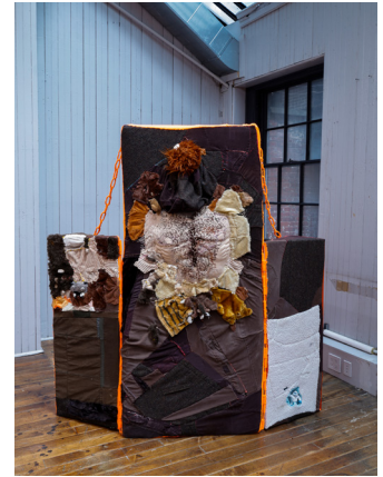
Baxter Koziol The Non-Man Incubation Chamber 2024 Toy hide, coat liner, faux fur, yarn, wire, foam, Abominable Snowman, Grizzlor 24 x 72 x 72 in 61 x 183 x 183 cm