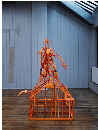
Baxter Koziol Invisible Man Security System 2024 New Dirt in orange, scaffolding safety harness, yarn, pine, trim nails, wire 36 x 40 x 72 in 91.5 x 101.5 x 183 cm