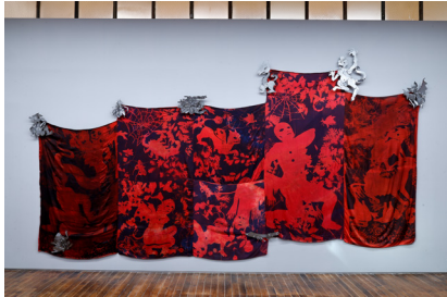
Tura Oliveira Deep Red 2024 Steel, linen, graphite, and hand-dyed silk 120 x 70 in 305 x 178 cm