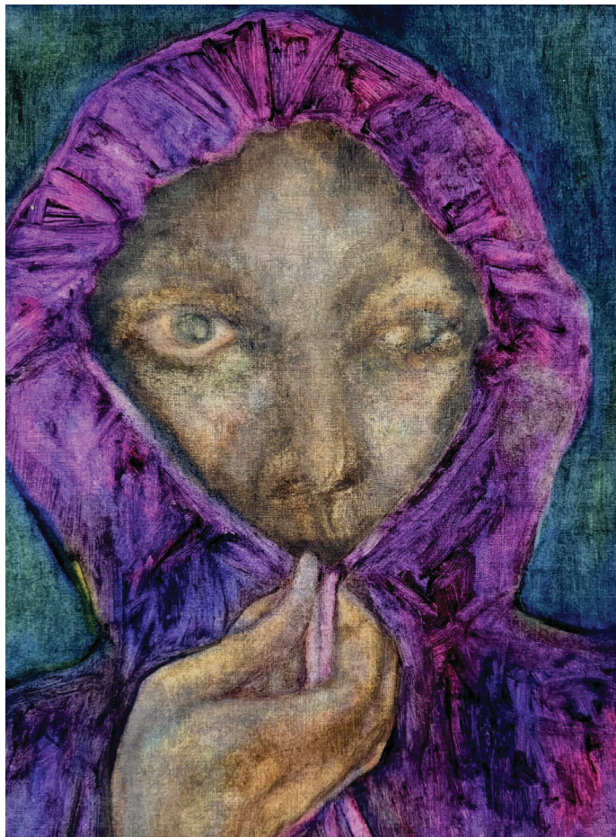
Pauline Rintsch, Untitled 2023, 56 x 42cm Oil on paper

Pinch Me Hard and Soft, a solo exhibition of German artist Pauline Rintsch has just opened at YveYANG. This marks Rintsch's first solo exhibition in New York. Akin to the acrobatic anguish in Balthus, Rintsch captures figures with dynamic poses in abstract settings, only magnified with an enigmatic femininity. Her fluid use of oil on paper enlivens uncanny psychological depth to each of her subjects—stale, moist, clunky and alive, transforming mundane feelings into subtle erotics, imperfect scenarios into magical tinkering. Exhibition text is by Hindley Wang.